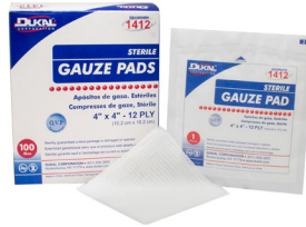
Gauze & Non-Woven Dressings