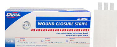
Wound Closure Strips

Find our full line of products at dukal.com