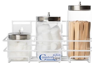
Exam Room Supplies